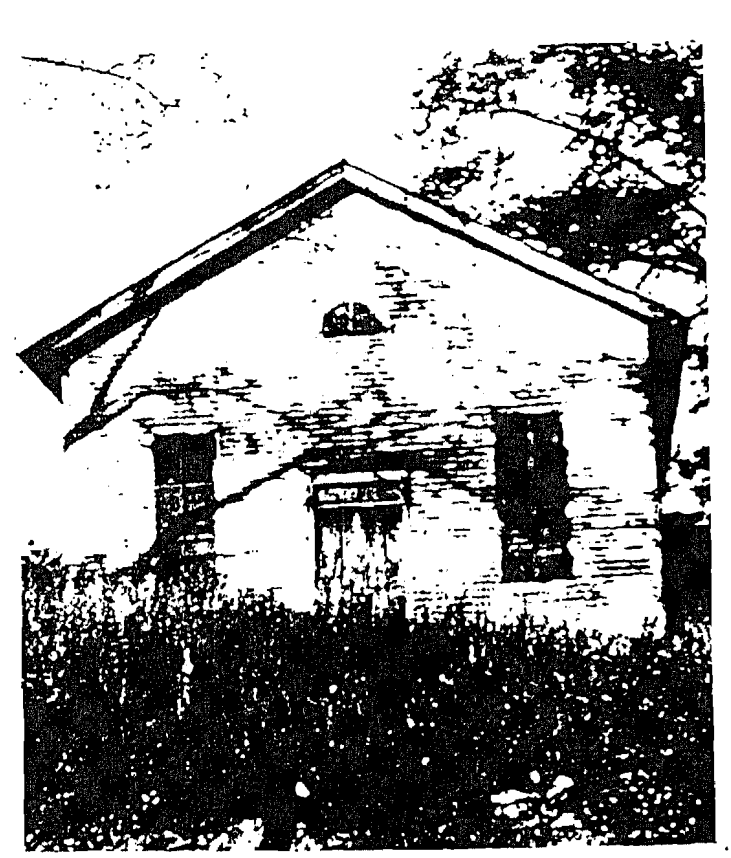
This photo shows the Welsh church after it had been abandoned. It sat facing East on Brittain Rd.; Howe Rd. run along the right hand side of the photo.

Mrs. Martha P. Bierce provides a personal sketch of the church in an article she wrote for the Tallmadge Sesqui-Centennial which was then published in the book, A History of Tallmadge, Ohio. According to her description, the church "was a small frame building with a seating capacity of 75 to 100. Perhaps its only claim to beauty was the unusual fan light [window] centered over the double front door. There were nice pews with green cushions, a chandelier for coal-oil lamps, and a coal burning stove. Upon the wall hung an antique clock which seemed to move its hands slowly for the tots who early were taught respect for the House of God and who must sit straight and still during the hour of worship."