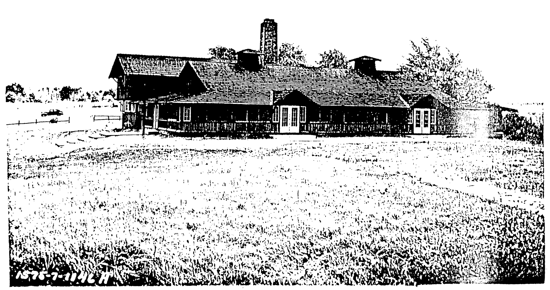
CAMP MANATOC DINING HALL, C. 1930s SUMMIT COUNTY, OHIO