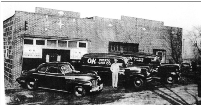
The OK Potato Chip Company was located in Kenmore on Florida Av the 1940s.