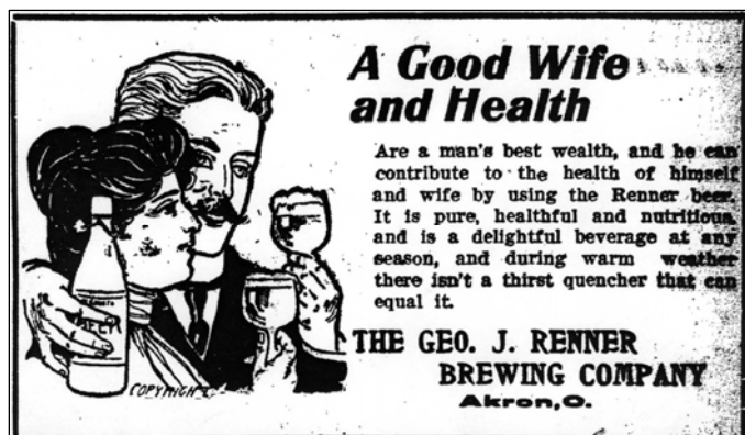
Advertisement appearing in the Akron Daily Democrat on May 22, 1902

The local World War II war brides clubs may be a thing of the past and the population of these war brides diminishing. Thanks to the enthusiastic coverage by the Akron Beacon Journal and other newspapers across the county, the publication of several books on the subject, and the efforts of the World War II War Brides Association, their stories will live on and will likely be joined soon by those of a new generation of war brides.