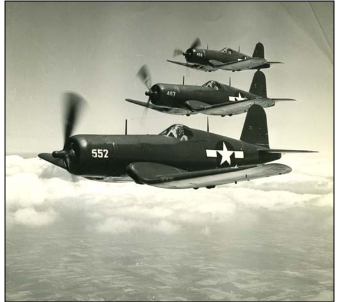
Corsairs in flight, from the U.S. Naval Air Station, Akron Collection. This image is available though www.SummitMemory.org at http://www.summitmemory.org/u/?airstation,22

trouble spot. As each plane was completed, it was rolled out to the tarmac where it awaited final adjustments and flight testing. It was here that Navy personnel corrected all minor defects and installed and test fired the machine guns at the firing range adjacent to plant D, no doubt rattling the nerves of many in the nearby residential area. The final stage of production found the newly completed airplane in the paint shop where a coat of Navy gray and the US insignia were added.