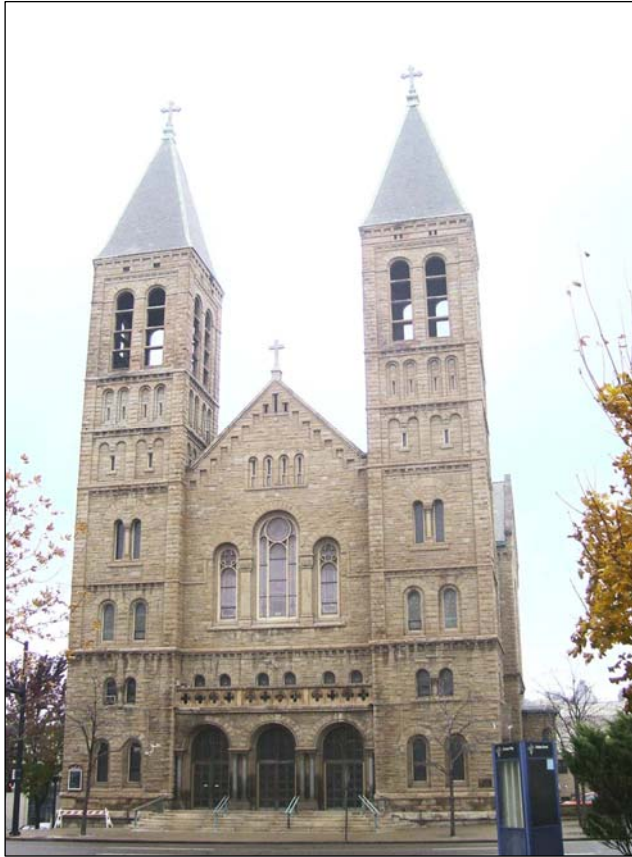
Saint Bernard's Church on Broadway.

donated 4,500 square feet of stained glass windows from Germany and statues from Italy. Murals and ornamental columns adorn the interior. Parish youth donated funds for the altar. The twin towers of the church continue to make it a landmark recognized by Akronites traveling downtown. Originally, the basement contained a chapel that held 850 people; today, that space is the church's social hall.