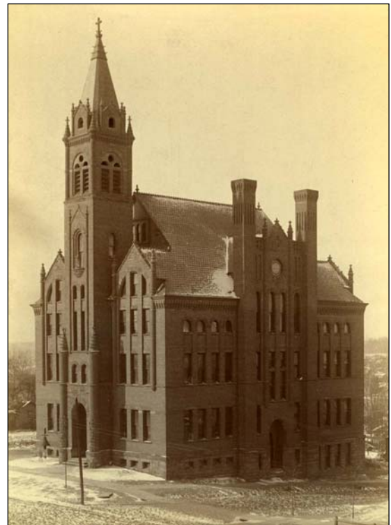
St. Bernard Parochial School, 1891.

Later, the Sisters of St. Dominic taught in the school. Classes were taught in German, but English eventually became the teaching language. After years of decline in enrollment, the school was closed in 1977.