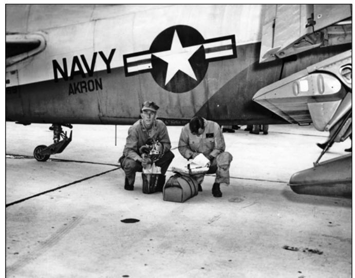
From the U.S. Naval Air Station Akron, Collection, this image is dated August 20, 1957. It is available through www.SummitMemory.org at http://www.summitmemory.org/u/?airstation,8

But the end of the war wasn't the end of the Corsair's association with Akron. Some area residents will remember the reserve U.S. Naval Air Station at the Akron Airport that functioned from 1948 through 1958. The airplane they flew – the Corsair. Many of these pilots who trained here in Akron went on to fly in the Korean War where the upgraded and rocket-equipped Corsair excelled in the role of ground support.