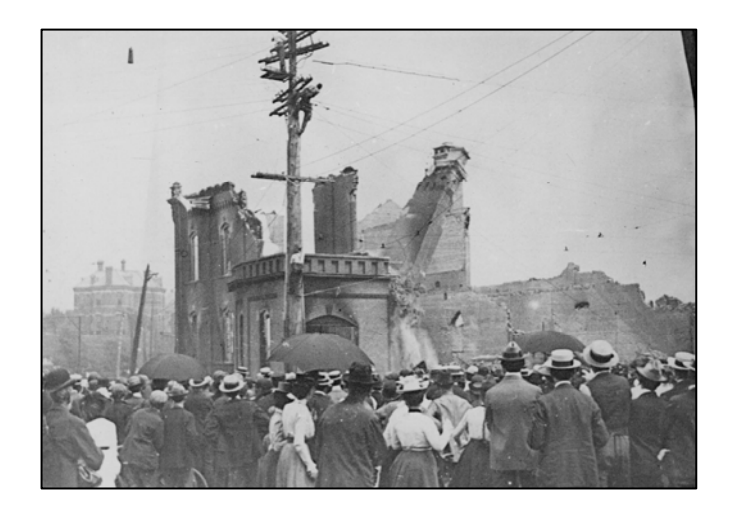
A crowd looks at the ruins of the Akron City Building on the corner of Main and Bowery Streets following the riot. From the Summit County Historical Society Collection.

The total losses by fire from the damaged buildings in the riot came to $107,594.50. This included City Hall and its contents, Columbia Hall, and the J.P. Whitelaw building. All of the plats, records, and maps of the city's engineering department had been destroyed. No fire insurance was collected because of riot clauses in the policies.