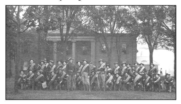
The 4<sup>th</sup> Regiment of the Ohio National Guard responded to the Governor's call to occupy Akron in August of 1900.

saloons were to be closed so that the influence of alcohol would not be allowed to further cause any other crimes or uprisings.