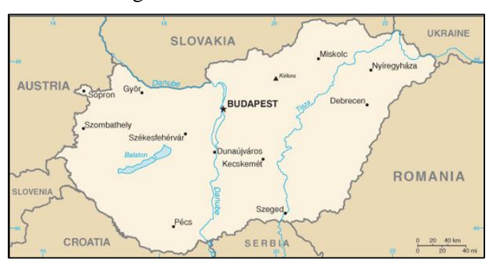
Present day Hungary borders countries that were previously part of the Austrian-Hungary Empire.

WWI. The number reveals just how many young men had immigrated to the Akron area immediately preceding the war. After the end of WWI, treaties redrew European borders, and it is important to realize that many who called themselves "Hungarian" prior to the war were from what today are now the Czech Republic, Slovakia, Romanian or the former Yugoslavia.