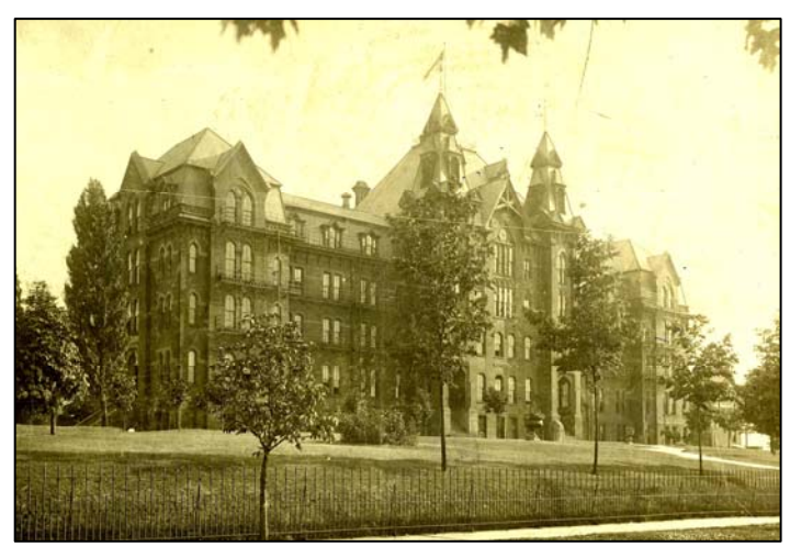
Buchtel Hall opened in 1872 on the site of the former Spicer Hill Cemetery. c. 1890s.

The funeral procession crept slowly up Buchtel Ave. (then Middlebury St.) and stopped at the crest of the hill. Their destination was the Spicer Hill burial ground in use since at least 1813 and with the exception of the Middlebury cemetery Akron's earliest cemetery. Positioned on the highest portion of the property owned by early Akron settler Miner Spicer, the site was presumably chosen with the thought that the elevation would guarantee good drainage. However, experience would show that this was not the case as the composition of the earth proved to make digging graves by hand difficult. Worse, the high content of shale and clay in the soil caused the gravesites to retain water, the