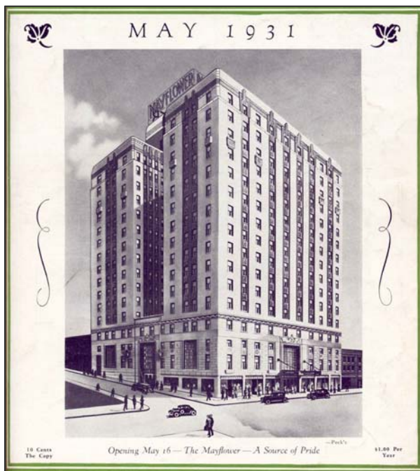
The Mayflower Hotel appeared on the cover of the Akron Topics Magazine in 1931.

Mayflower arrived during the golden age of the urban downtown, from the 1920s through the mid-1960s. Business, commerce, and entertainment were all concentrated within a few city blocks, and hotels were both the natural, necessary outgrowth of that, and the focus of much of it. The lower floors of a hotel weren't just places for restaurants, bars, and conference rooms; they also provided retail space and entertainment venues. If you needed aspirin or wanted a soda, you could visit Rutledge's Drug Store at the foot of the Mayflower. If you wanted to dance all evening to the music of a big band, you might consider going to the Mayflower's Hawaiian Room. Even if you just wanted to go to a movie, you could find yourself at the Marne, where the first three floors were the Allen Theater.