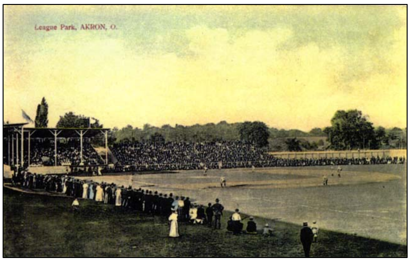
Postcard of League Park from Celebrating Akron in Picture Postcards published by The Summit County Historical Society in 2000.

If you're a baseball fan like me, the end of winter signifies more than just a change of seasons. It indicates that the baseball season is just around the corner. Akron is very fortunate in that the Cleveland Indians are just a short drive away and we're also blessed to have our own minor league team in the Akron Aeros. Some might think that baseball in Akron began with the arrival of the Aeros in 1997, but that would not be accurate. The roots of organized baseball in Akron go all the way back to just after the Civil War. Over the years, Akron has had several teams with league affiliation that played at various baseball fields around Akron, but no park was more prominent than League Park. (continued on page 3)