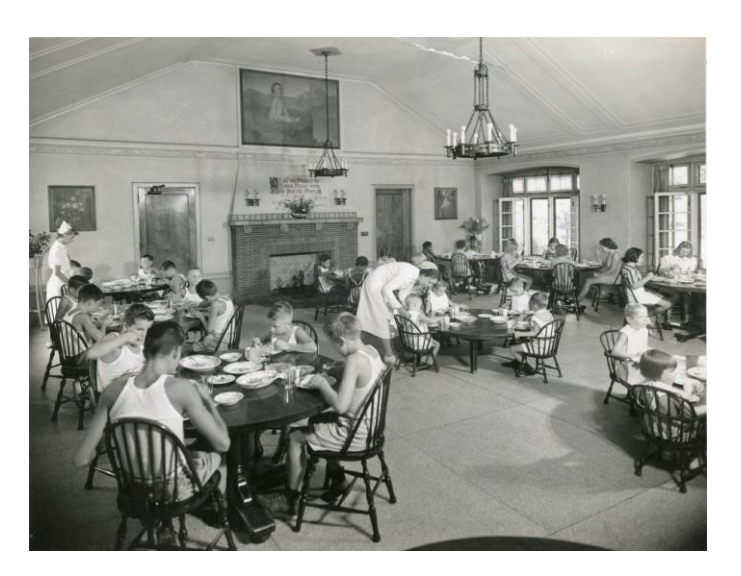
Sunshine Cottage children in the dining hall.

A new addition to Summit Memory is the Edwin Shaw Hospital Collection, contributed by the County of Summit. This unique collection includes more than 30 images from the early decades of the hospital originally known as Springfield Lake Sanatorium. The sanatorium, which opened in East Akron in 1915, was constructed for the treatment of tuberculosis patients prohibited from receiving treatment at general hospitals. This historic collection includes images of the facility and grounds located on former farmland near Springfield Lake, as well as the Sunshine Cottage, the sanatorium's pediatric center which championed the "sun cure" and open-air learning for children at risk for developing tuberculosis.