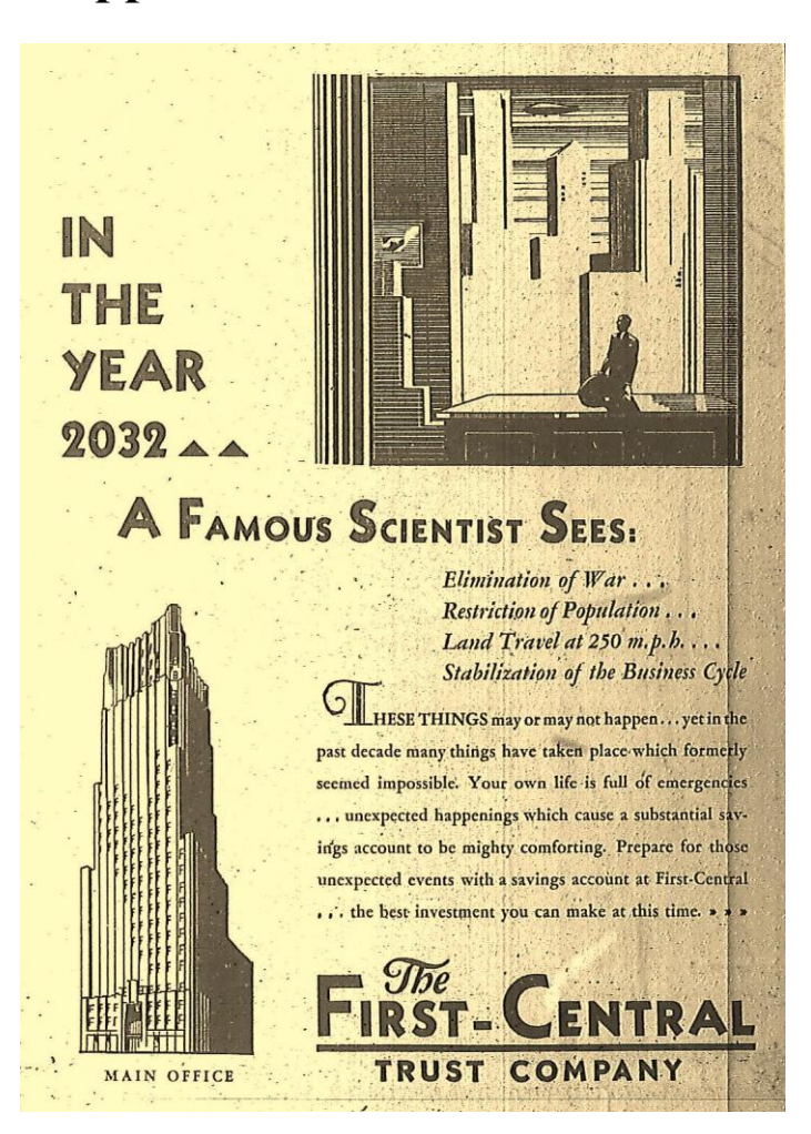
This unusual advertisement appeared in the Akron Beacon Journal on January 5, 1932. The building pictured is now FirstMerit Tower.