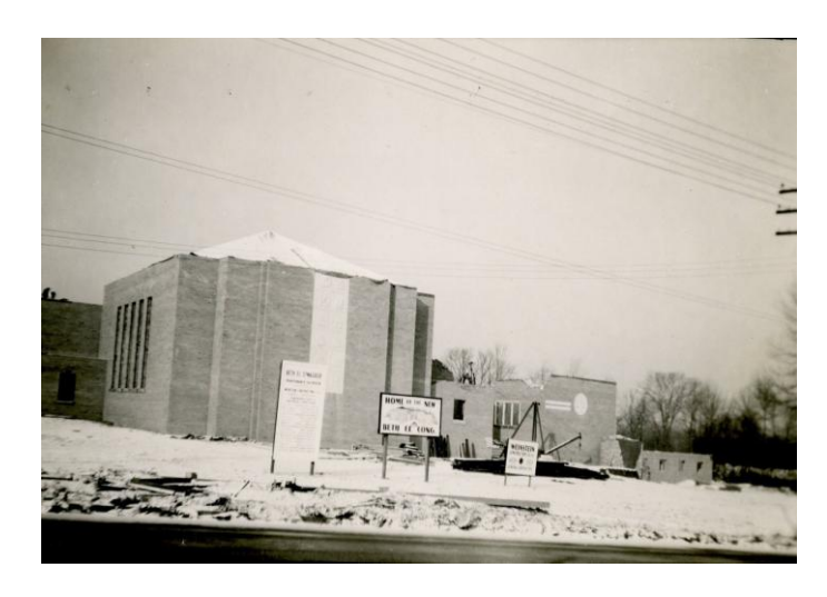
Construction of the Beth El Synagogue near completion, about 1951.

Akron women with a mission to educate members of the community about civic responsibility, to promote volunteerism and to support projects that fulfill a need in the community however possible.