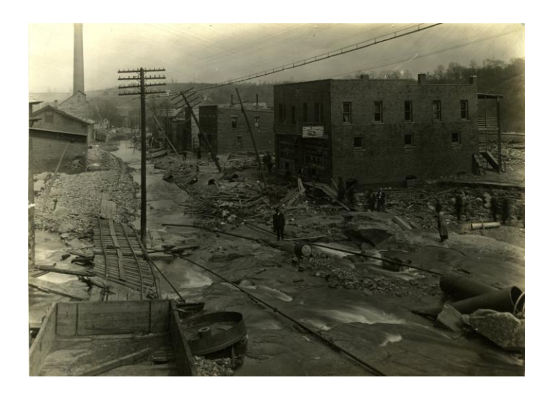
The effects of the Flood of 1913 on Case Avenue.

a repeat disaster of this magnitude over the past century.