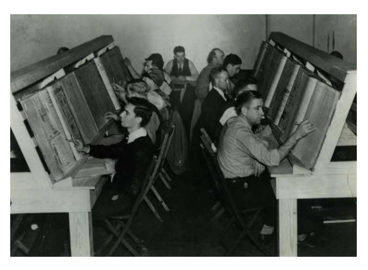
WPA employees indexing the Akron Beacon Journal.

Today, digitization can make full page images of historic newspapers available and searchable with a few clicks of a mouse button. Take a look at our database Access NewspaperArchive and the Library of Congress' Chronicling America project for excellent examples. We're hoping that soon, the Akron Beacon Journal will be digitized with full page images and high search capabilities. Newspaper digitization programs are growing as funding becomes available, so perhaps it's only a matter of time. We can only imagine the treasure trove of local history and genealogy that will open up to us when all of our local newspapers appear in searchable digital image form. In the meantime, we have the Akron Beacon Journal index to help us find and understand the people and events that have shaped the history of our area.