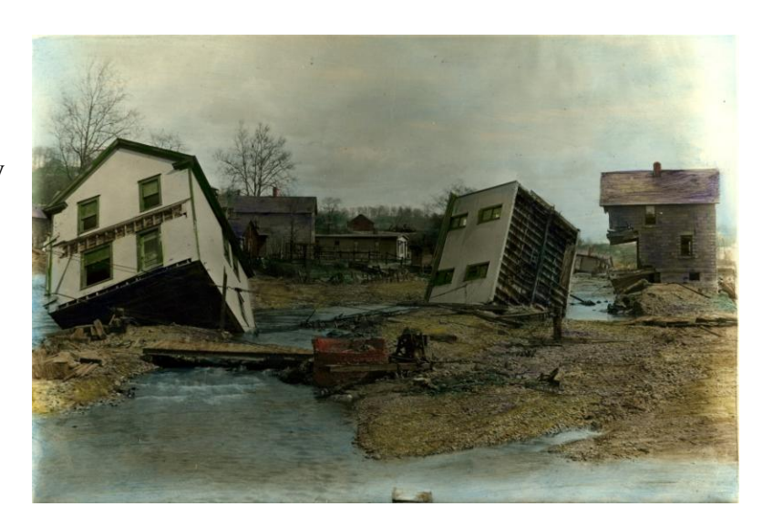
Buildings on East North Street wrecked by the Flood of 1913.

A century ago, Ohioans endured what is generally held to be the worst disaster in the state's history. The Great Flood of 1913 devastated parts of Ohio as flood waters overtook entire communities and resulted in monumental losses throughout the state. The massive flood claimed more than 400 lives statewide and left thousands homeless, dispossessed by a torrent that ripped houses from their foundations and carried away nearly everything in its path. The disaster would prove a catalyst for change, as those who experienced the Great Flood resolved to prevent any such disaster from ravaging the state again.