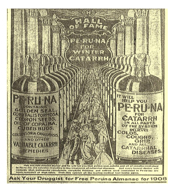
A curious remedy advertised in the Akron Beacon Journal, January 11, 1908.

The Akron-Summit County Public Library Special Collections Division is located on the third floor of the Main Library.