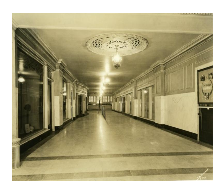
Interior of the Palace Theater about 1930.

Did you know that in addition to our own photo collection, we also house the photos of the Summit County Historical Society? Their large photo collection documents some interesting local people, places and events. Many photos have been digitized on Summit Memory, but there are also many that remain in storage. Most of these are cataloged in our Local History Database, and they are safely kept for researchers and curious citizens who need only to stop in and ask us to view them. This fall, we are highlighting photos of unusual or rarely seen subjects that you might not know exist. Come in to see "Random Rarities: Photo Gems from the Summit County Historical Society" in our display case.