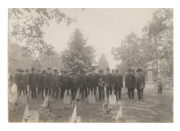
Veterans assembled at the GAR plot in Glendale Cemetery about 1900.

membership of Buckley Post realized that no "yearbook" or post history had been kept. A small booklet produced later that year outlined the post's history up to that time. In reference to the Post's burial lot it stated: "The officers of the Akron Rural cemetery have generously donated to Buckley Post, #12, G.A.R., a suitable lot in which to bury their deceased comrades, and the post has also made use of it as a place of burial for ex-soldiers, who would otherwise be consigned to Potter's Field." Indeed, several area men who were not members of the GAR but were indigent ex-soldiers were buried in the lot at Buckley Post's expense.