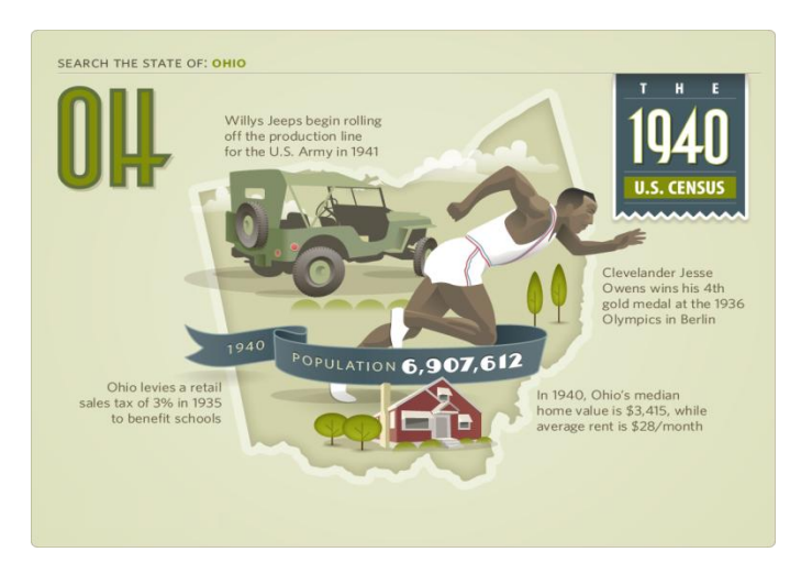
Image from the <u>Ancestry.com blog</u> post <u>Infographics: What Was Life Like in 1940?</u>, August 23, 2012, reprinted with permission.

Between the Ancestry index and the 1940 Census Community Project index, you may be able to find your ancestors without too much trouble. If you need assistance, feel free to contact Special Collections for search tips. Or, refer to the workbook we use in our "Finding Your Family in US Census" class, which may be found on our blog at http://sc.akronlibrary.org/, under the Classes & Events tab. If you still have trouble with the name indexes, remember, you may use the 1940 census the "old-fashioned" way, by identifying the enumeration district in which your ancestor lived and then browsing the pages within it. For instructions, refer to the National Archives and Records Administration's census page at http://1940census.archives.gov/ or our own research guide on the topic, found under the Genealogy tab.