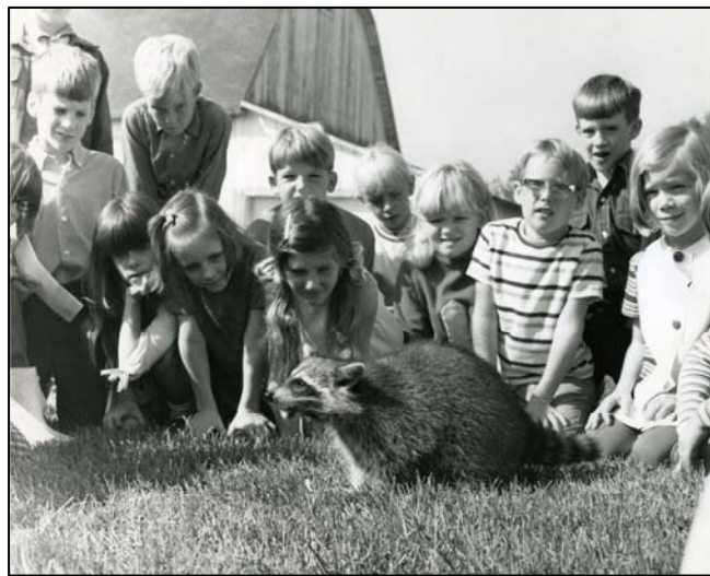
Boo the raccoon entertains children at the Seiberling Nature Center in July, 1972.