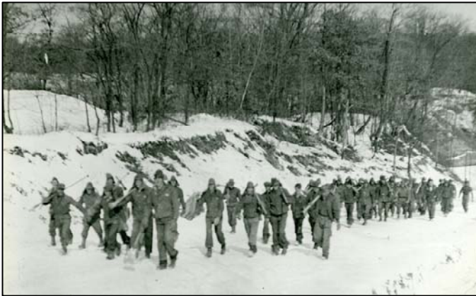
Company 577 of the Civilian Conservation Corps (CCC) returning to camp on Sand Run Road in 1934. From the Metro Parks, Serving Summit County Collection.

The stock market crash of 1929 and the Great Depression that followed were a time of hardship for many Americans, but Franklin D. Roosevelt's New Deal proved beneficial to both the residents and the parks of Summit County. Following the creation of the Civilian Conservation Corps (CCC), many residents went to work on public projects, and many of those projects were in the parks. The influx of labor and resources allowed the Akron Metropolitan Park District to complete a variety of projects and even open new parks.