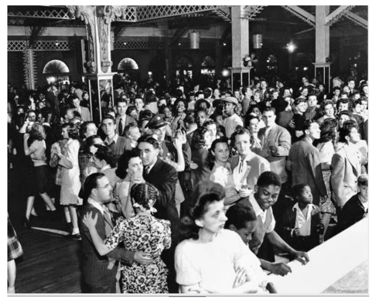
A crowd in the Wisteria dance hall at Summit Beach Amusement Park during a Goodyear Aircraft Company picnic, August 20, 1943.

The Akron-Summit County Public Library Special Collections Division is located on the third floor of the Main Library.