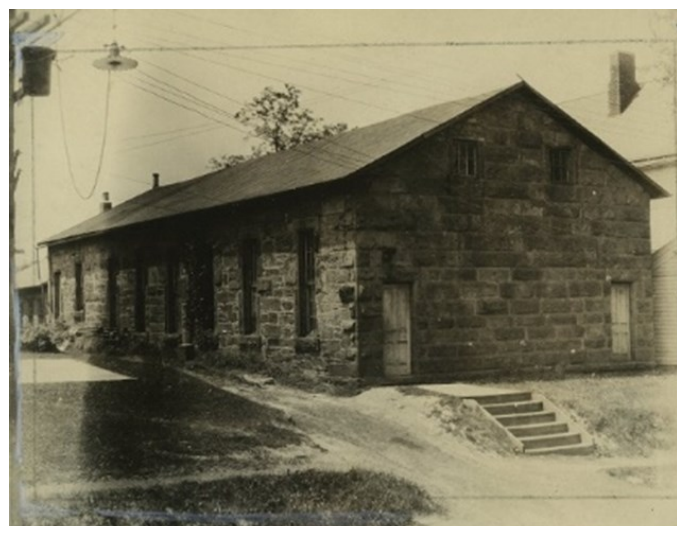
Old Stone School, or the Twinsburg Institute. From the Akron Times-Press, July 17, 1925.

The area is now preparing to celebrate its bicentennial with a Founder's Day on July 22<sup>nd</sup> on the Twinsburg Public Square, and commemorative events will continue for the rest of the year. Visit Twinsburg200.com for event listings, a historical timeline, stories, and picture gallery. Also included is a list of corrections to Twinsburg, Ohio: 1817-1917 , the book published in honor of the township's first hundred years. For those who love to explore history, the website is a compelling journey into the past.