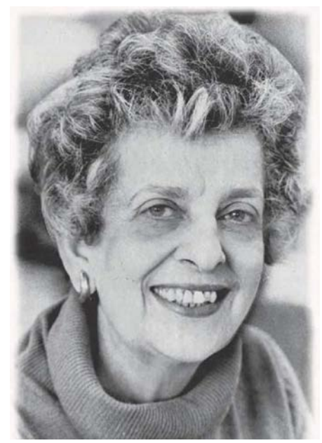
Akron Beacon Journal, May 27, 2005.