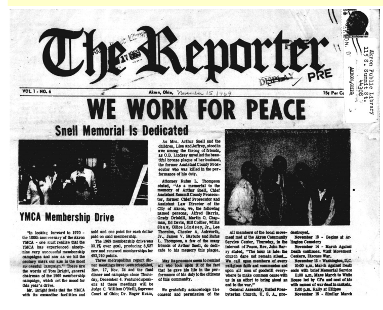
One of the first issues of The Reporter, November 15, 1969. The Library has maintained the newspaper from its first issue.