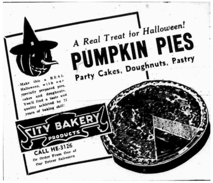
The City Bakery operated six stores in the mid-1930s including locations on Grant Street and South Main Street. Akron Times-Press, October 27, 1936.

The Akron-Summit County Public Library Special Collections Division is located on the third floor of the Main Library.