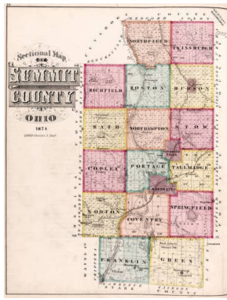
Sectional Map of Summit County, Ohio, 1874.