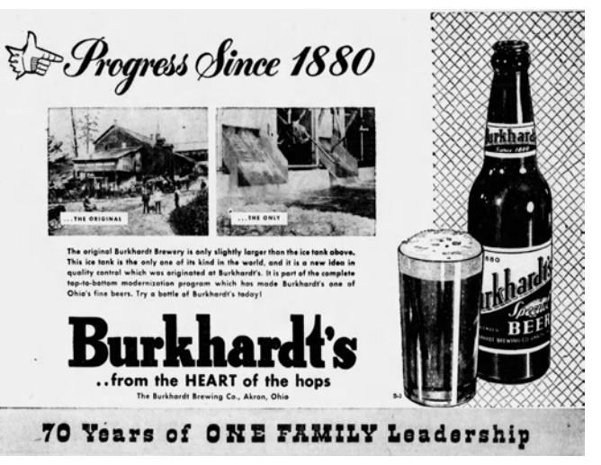
The Burkhardt Brewing Co. ran this advertisement in the Akron Beacon Journal on April 26, 1950.

Breweries struggled through the years of Prohibition, attempting to adapt by creating non-alcoholic brands and soft drinks. Few came back to success after Prohibition's repeal in 1933. After World War II, the local brewing industry declined as national brewers with significant capital became too powerful for competition. Renner and Burkhardt both ceased operations by the early 1950s.