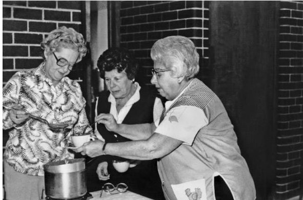
Women making candy at the Shaw Jewish Community Center in Akron, 1982.