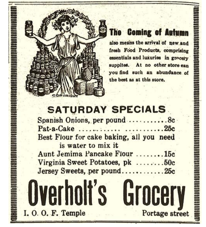
Specials at Overholt's Grocery reveal "new and fresh" fall foods. There's nothing pumpkin-flavored here. Cuyahoga Falls Reporter, September 26, 1919.

The Akron-Summit County Public Library Special Collections Division is located on the third floor of the Main Library.