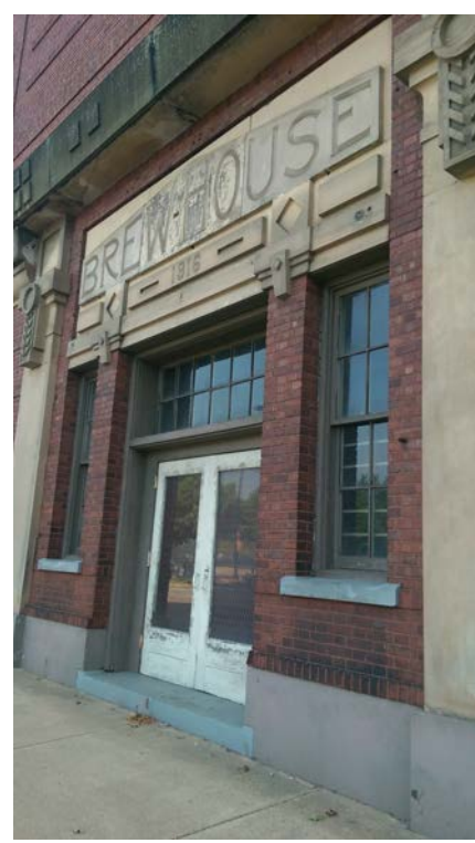
The Akron Brewing Company building just before its demolition.

As I wind down the last few months prior to my retirement, I have reflected on these stories, along with so many others. Although I have always considered librarianship to be a profession of helping, and indeed it is, the rewards for me have been immeasurable. I will always keep that email from the gentleman in Virginia, along with the memories I have preserved from stories such as these as a reminder of the grace and goodness and importance of our work, even just the small things.