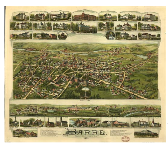
Barre, Massachusetts, 1891.