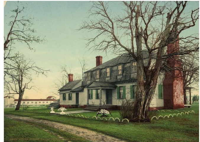
House of Cornwallis's Surrender, Yorktown, Virginia.