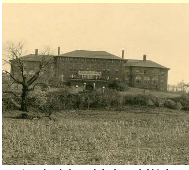
An undated photo of the Springfield Lake Sanatorium, later Edwin Shaw Hospital. From the Edwin Shaw Hospital Collection, Summit Memory.