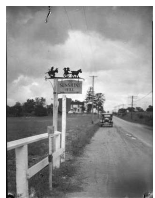
Signpost pointing the way to Sunshine Hill, ca. 1920s.

But it kept a low profile, and its unusual status made it somewhat mysterious to those who weren't familiar with it. A 1987 Akron Beacon Journal article noted that few residents knew what kind of hospital Edwin Shaw was, or where it was located, "since it isn't situated along any busy road and it isn't even visible from one." There were several proposals to increase services during the 1980s and 1990s, including a nursing home for AIDS patients, but none took hold.