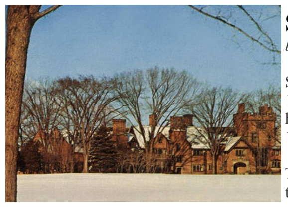
Stan Hwyet Hall in winter.