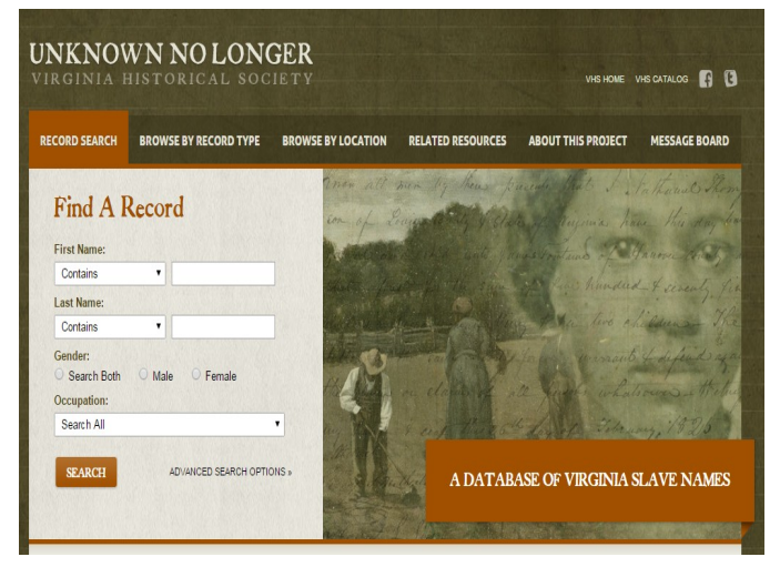
The documents digitized on Unknown No Longer contain valuable historical and genealogical data.

FamilySearch includes searchable databases of vital records as well as image-only military and probate court records. In addition, a useful directory linking to online sources for Virginia as well as many other states can be found at FreeSurnameSearch.com.